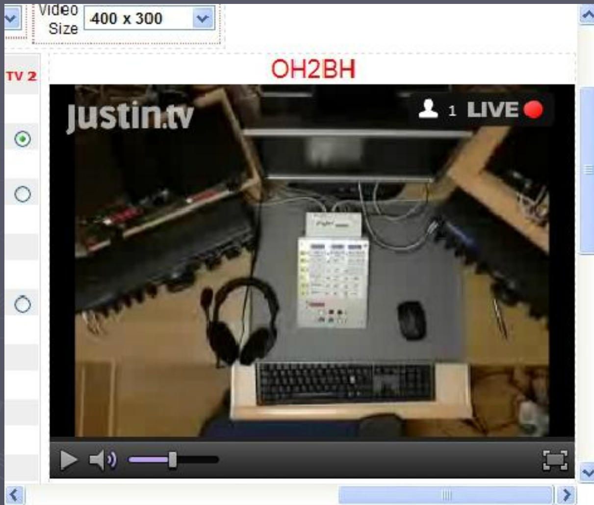
Partial screenshot from cqcontest.ru (Tnx SM5AJV)